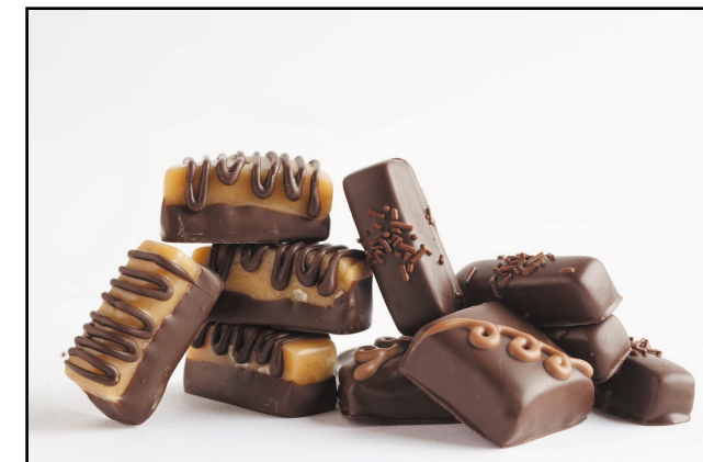
Chocolate making class for 12 from Cocoa Dolce