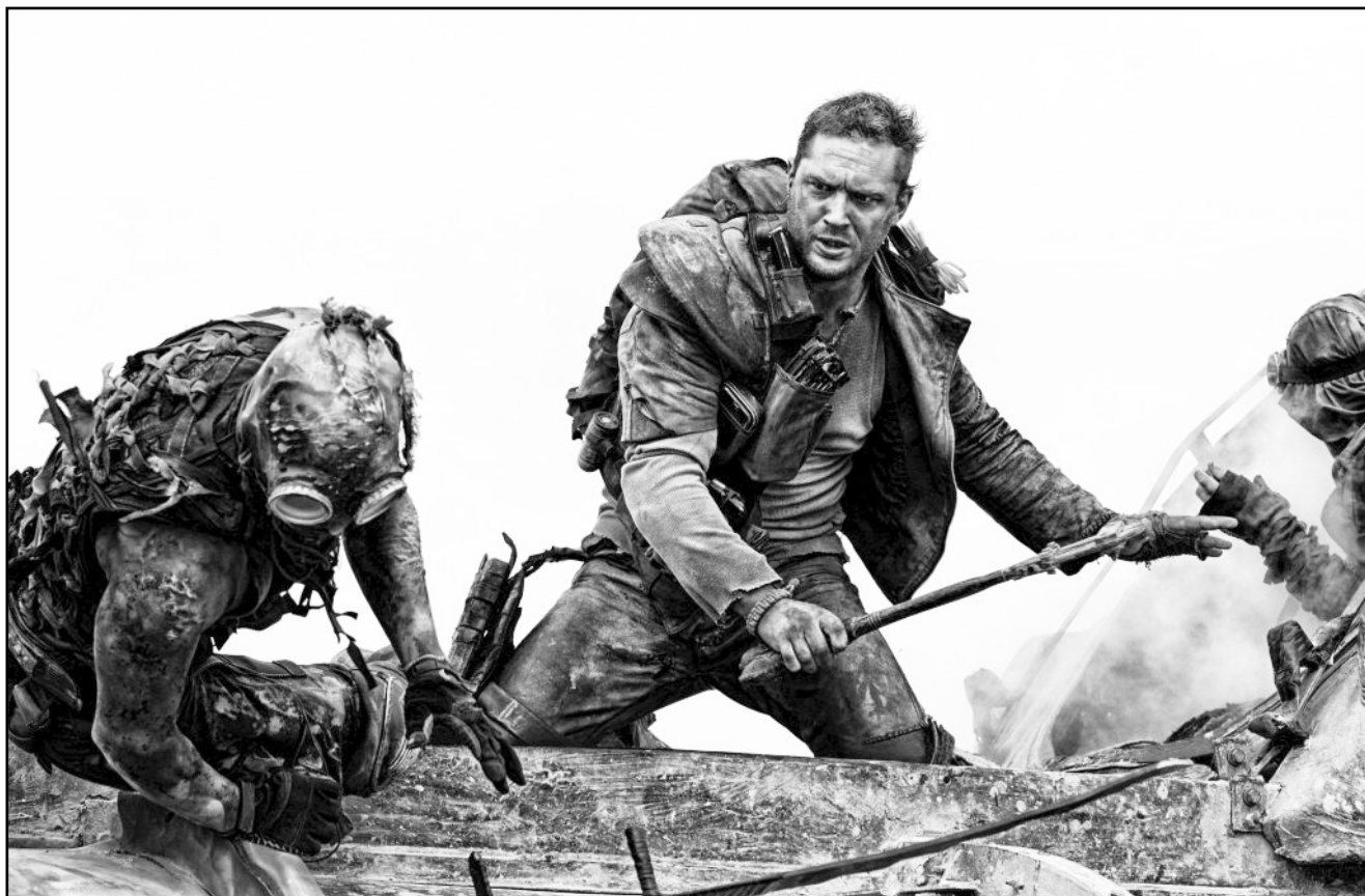
THE NEW MAX: English actor Tom Hardy (you may recall him as Bane from The Dark Knight Rises ) replaces Mel Gibson as the title character, Max Rockatansky, and this time the character is significantly more mad.