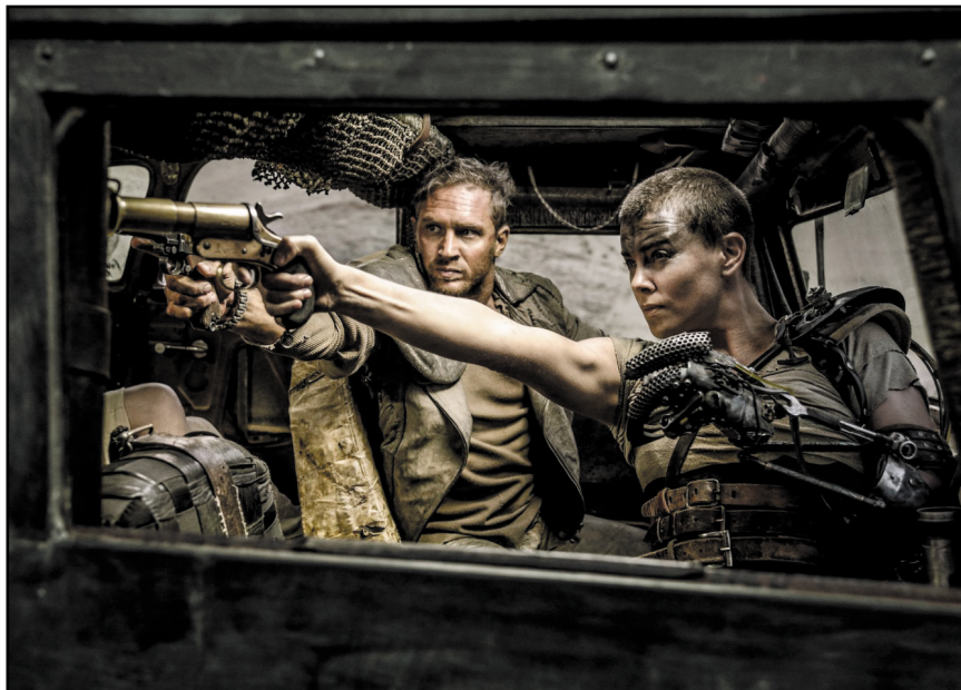
WOMAN POWER: Charlize Theron steals the show as Imperator Furiosa, a woman hell bent on freeing other women that a warlord has turned into property.

This evolution — combined with a different actor — leads to a very different, much more haunted character. Gone is Gibson's overly confident and handsome mug, replaced with a wild-eyed, paranoid wasteland survivor with a ferocious violent streak. Physically and psychologically, Hardy's interpretation is one of desperate survivalism approaching the verge of complete breakdown. Within that veneer lies a paladin in search of a